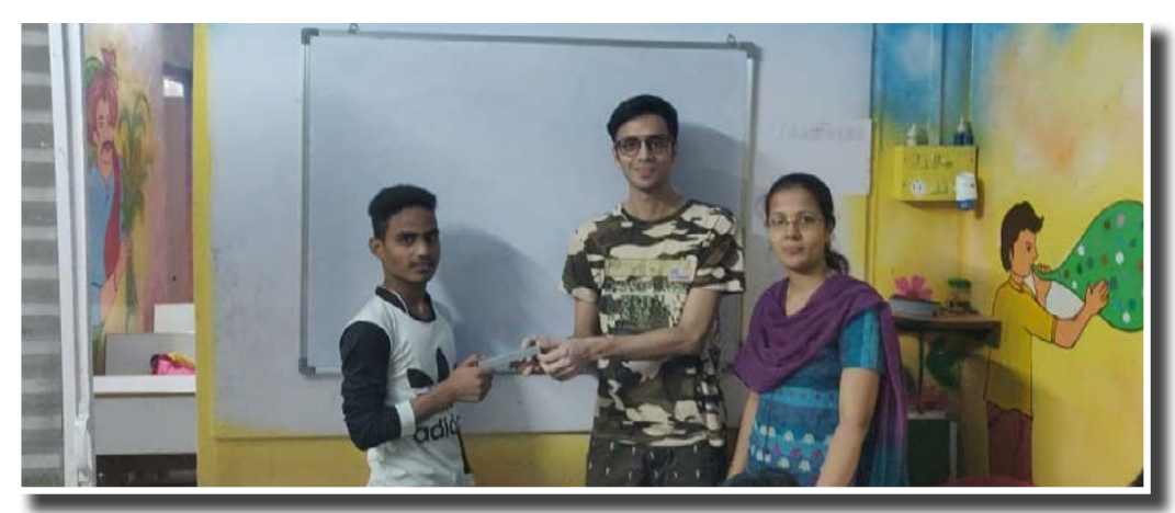
REWARDING STUDENTS FOR GOOD PERFORMANCE IN SCHOOL